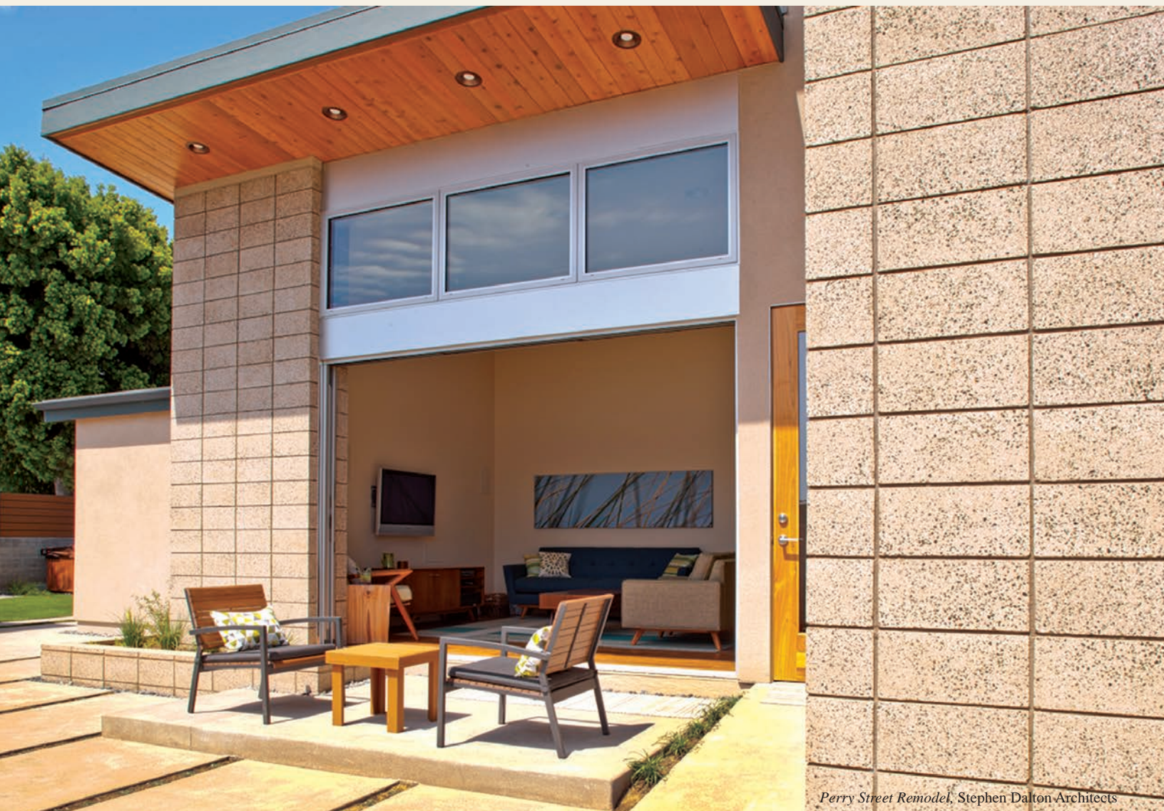
Perry Street Remodel, Stephen Dalton Architects

Concrete Masonry Association of California and Nevada