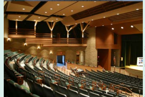
Photography: Tuman Photography