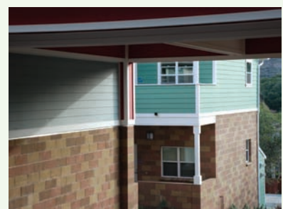
Photography: Curtis Cornane, Mainstreet Architects + Planners, Inc.