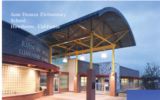
Juan Deanza Elementary School Hawthorne, California