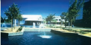
EXTENDED EDUCATION CSU DOMINGUEZ HILLS