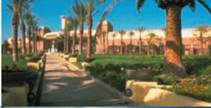
GENENTECH BUILDING 26