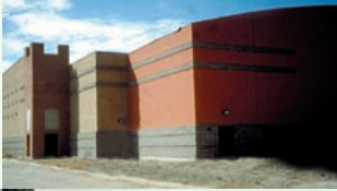
THE COUNTY TELEGRAM-TRIBUNE BUILDING