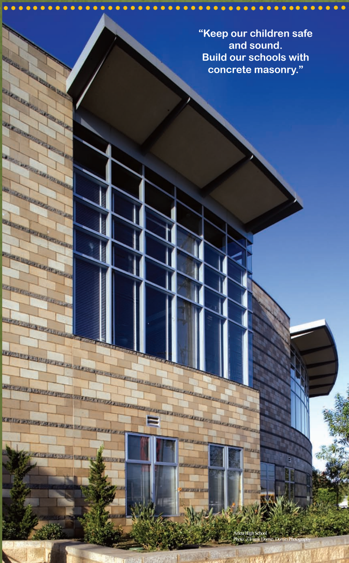
Arleta High School

“Keep our children safe and sound. Build our schools with concrete masonry.”