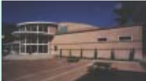
ROLLING HILLS CHRISTIAN CHURCH EL DORADO HILLS, CA