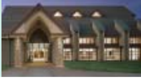
CASA BLANCA FAMILY LEARNING CENTER RIVERSIDE, CA