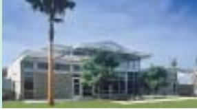
MERCY HIGH SCHOOL MULTI-PURPOSE ATHLETIC FACILITY SAN FRANCISCO, CA