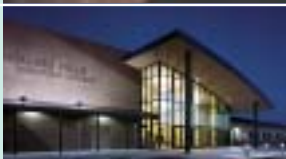
COUNTY OF SONOMA SHERIFF'S HEADQUARTERS & REGIONAL DISPATCH CENTER SANTA ROSA, CA