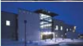
M. GORDON CLARKE FIELD HOUSE/UNIVERSITY UNION CAL STATE UNIV. SAN MARCOS, CA