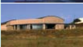
GANGI DEVELOPMENT OFFICES LOS ANGELES, CA