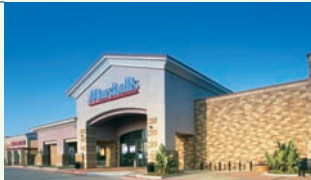
ANGELUS BLOCK HEADQUARTERS SUN VALLEY, CALIFORNIA