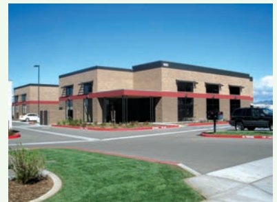
Photography: Danny Ficarra, MW Architects, Inc.